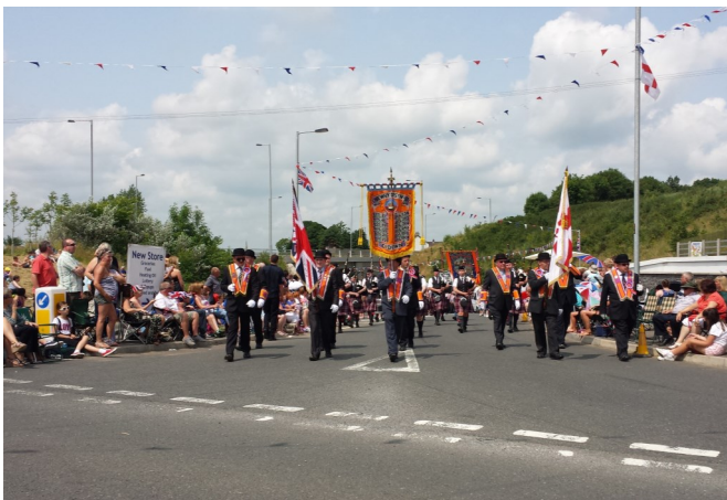
12th July parade visited by Dublin C4 delegation

July also saw a delegation of community activists from Dublin travel to Belfast to take a 'closer look' at the bonfire and parading traditions of the loyalist / unionist communities on 11th & 12th July. The purpose of the trip was also to learn more about the joint efforts of communities in interface areas to ease tensions and curb violence.