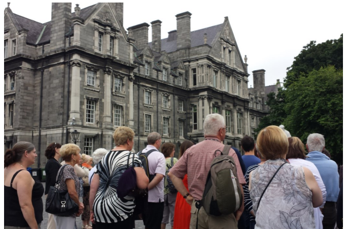
Senior Citizens' Event—cultural trip to Trinity College