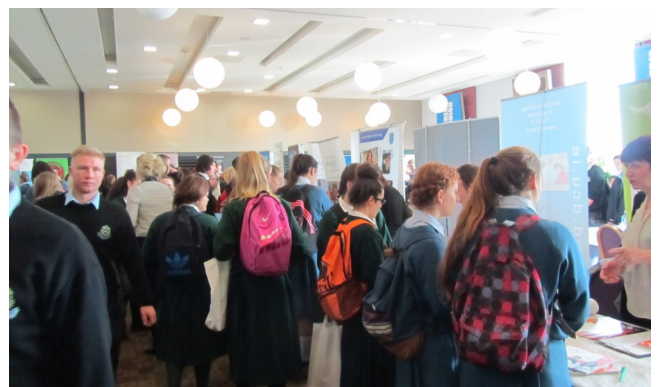
Students speaking with education providers