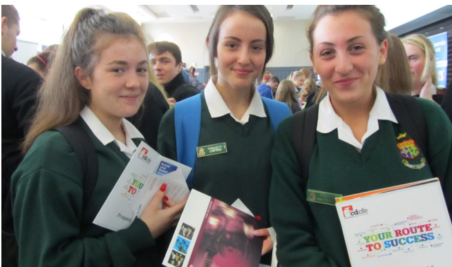
Mercy College Students at Education Fair