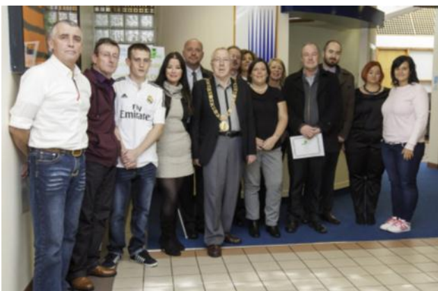
Jobs Club graduates pose for a group photograph with the Lord Mayor.

Greendale Jobs Club is part of a suite of services offered by Northside Partnership's Local Employment Service to support people who are looking for work in north east Dublin. Participants sign up to a two-week programme which provides a mixture of group and one-to-one supports designed to help job seekers with their motivation, CV preparation, interview techniques and communication skills. So far in 2014, 315 people have taken part in the two-week programme with 80 progressing into full-time employment, work placements or further education and training. Following the success of this event, the Jobs Club are looking forward to February 2015 when participants will meet the Lord Mayor for coffee and an employment networking event.