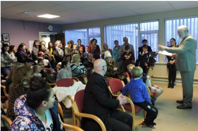
Proud families and teachers wait for the presentation of prizes to the winning students.

This year, the competition sought entries on the themes of "Autumn" or "Battle of Clontarf" and was open to all students from Junior Infants in primary school up to 2 nd year in secondary school. Competition was very strong with over 500 entries received from 13 different schools in north east Dublin and it was very difficult for the judges to pick the eventual winners from a very strong field. To view the full winners listing, click here .