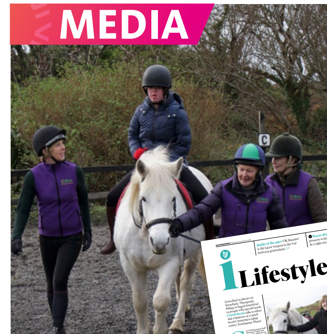
Social Enterprise Connemara-style: Therapeutic Riding in action

Therapeutic Riding (TR) is an equine-assisted activity which can be effective in improving balance, co-ordination, emotional control, self-confidence, self-esteem and community integration. It provides an intense, multi-sensory experience, can aid core muscle tone and posture, support the development of motor ability as well as helping with sensory and social skills. It’s a rich cocktail of really big positives.