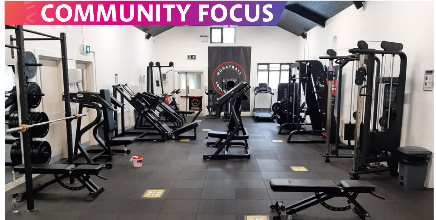
A weighty facility: Moneygall Community Gym, Co Offaly