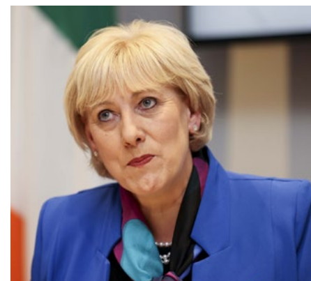
Minister Heather Humphreys

Funding for this scheme is provided from the Dormant Accounts Fund. Launching the initiative in September