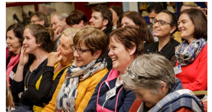
Social Enterprise Expo 2019

“They trained up people who wouldn't easily get work elsewhere, people who were ex-drug addicts, ex-offenders, people with disabilities, so there was a benefit there and because the labour is from the local community and the activity is based in the local community, there is economic gain for the area as well. You've got a triple benefit in that social economy project.”