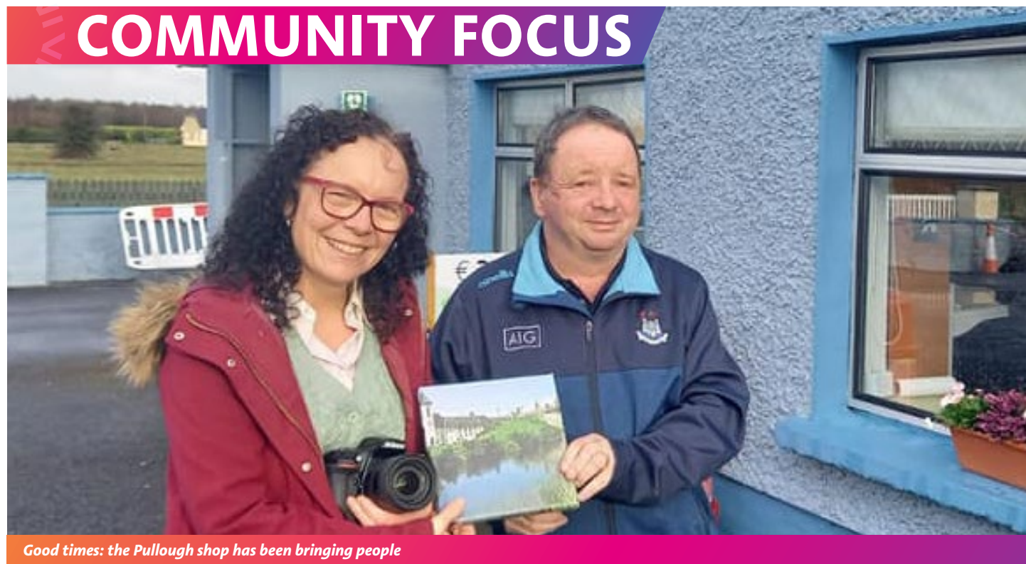
Good times: the Pullough shop has been bringing people