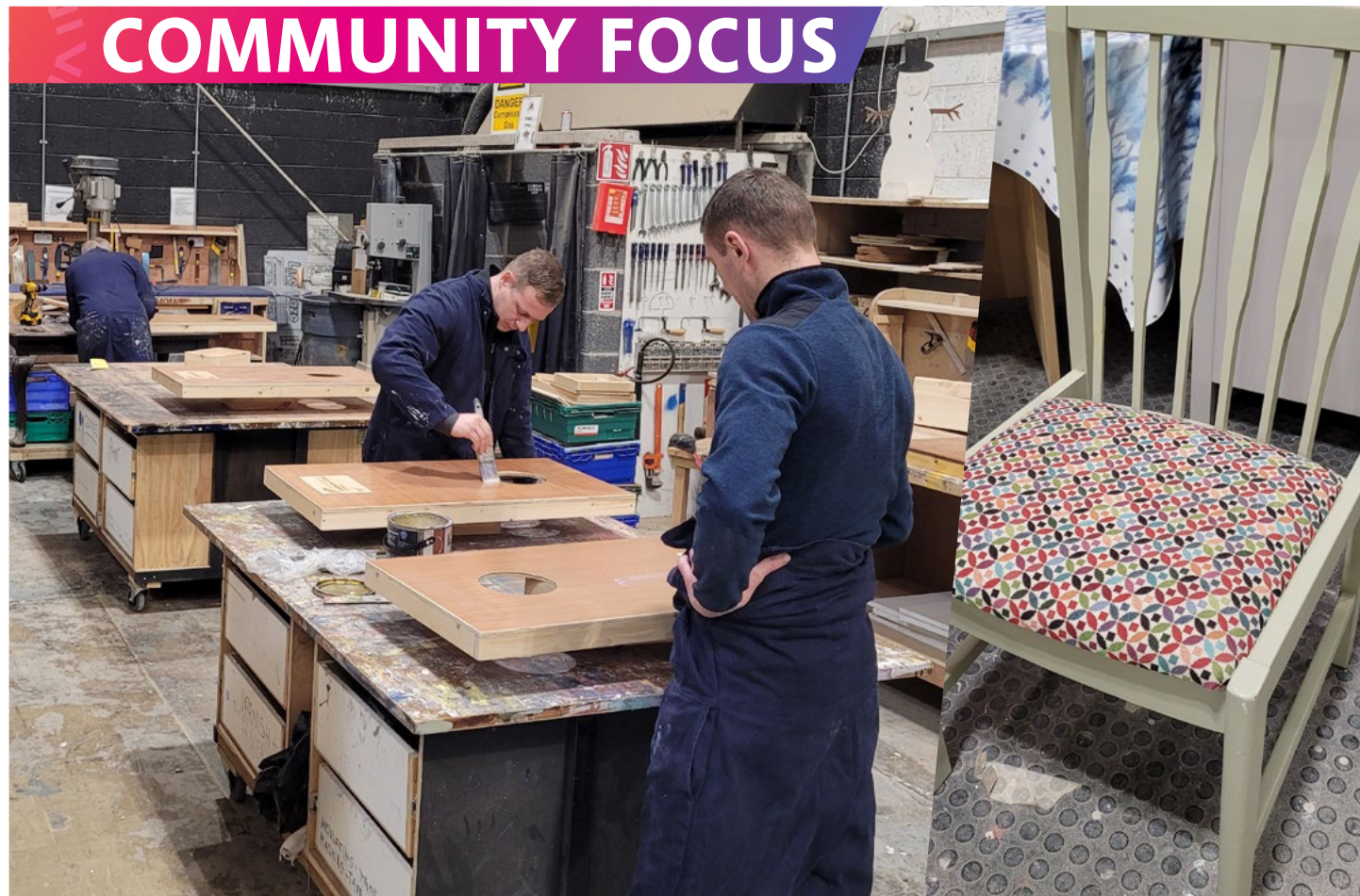
Good work: The Cairde Enterprises workshop in Limerick