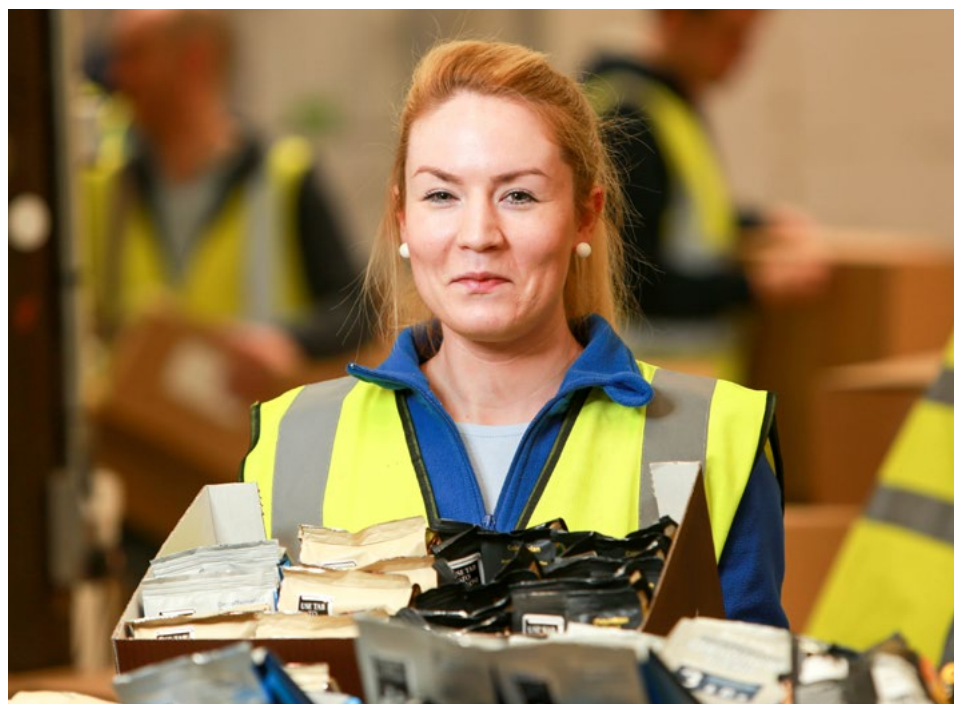
Worker in Speekpak, a Dublin based Social Enterprise dedicated to providing efficient, reliable and innovative packing and e-commerce fulfilment solutions

Part of the Awareness Raising Initiatives for Social Enterprise (ARISE) Scheme 2021